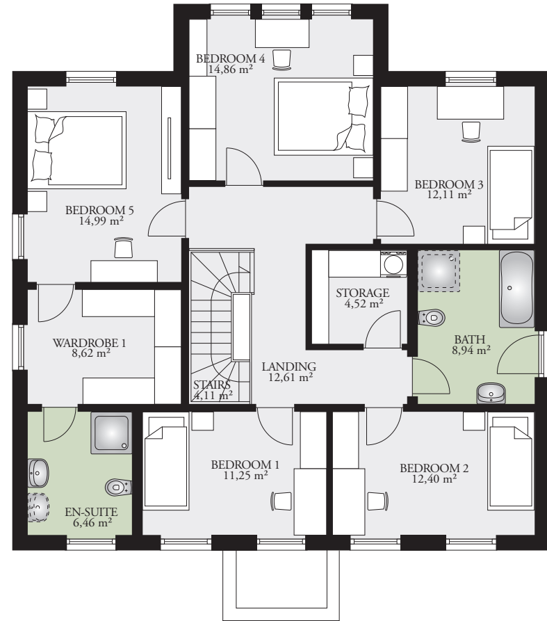
FIRST FLOOR AREA 118,84 m 2 (1279 sq. ft)