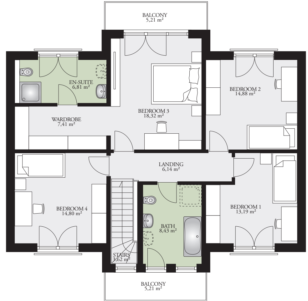
FIRST FLOOR AREA 99,67 m 2 (1073 sq. ft.)