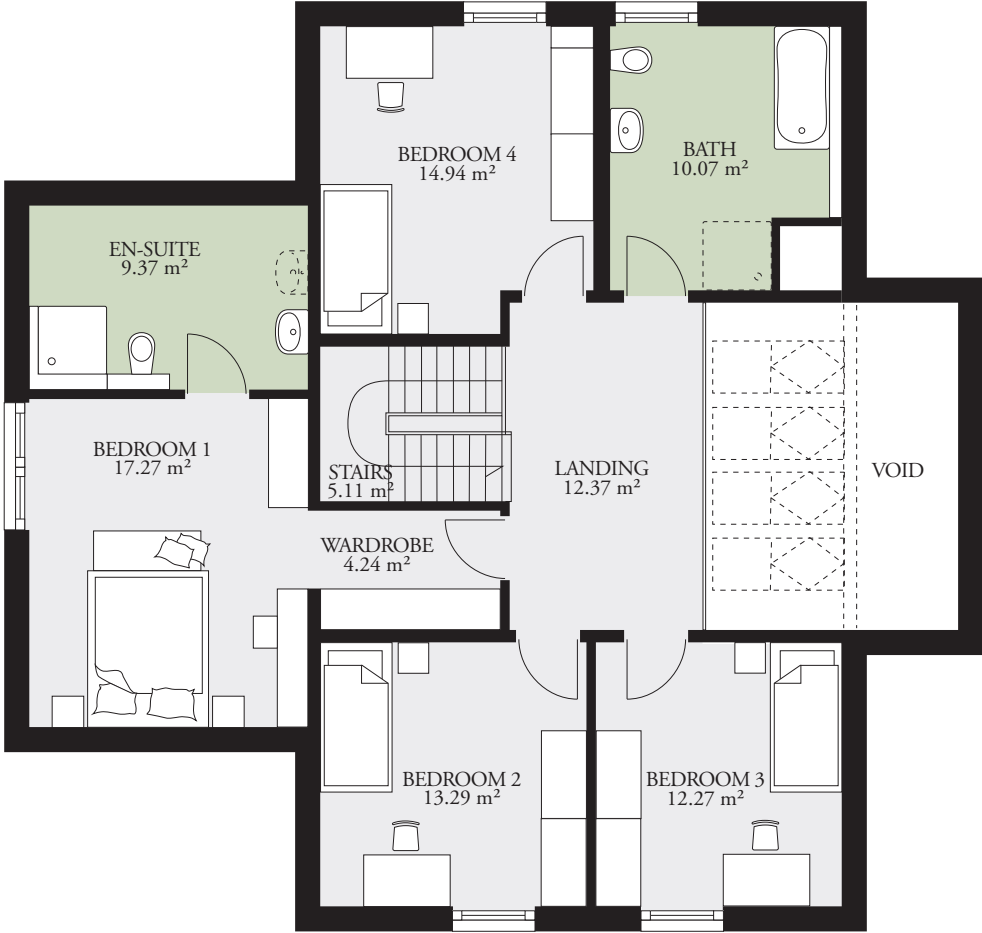
FIRST FLOOR AREA 106.83 m 2 (1,150 sq.ft.)