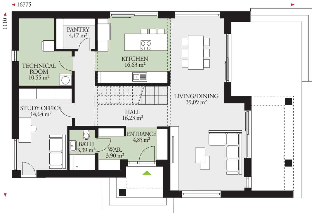
GROUND FLOOR AREA 118,90 m 2 (1280 sq. ft)