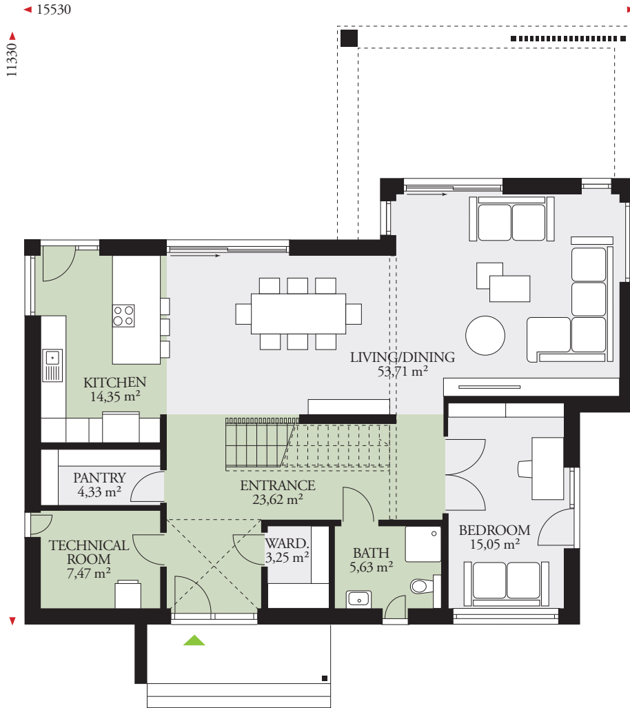
GROUND FLOOR AREA 132,39 m 2 (1425 sq. ft)